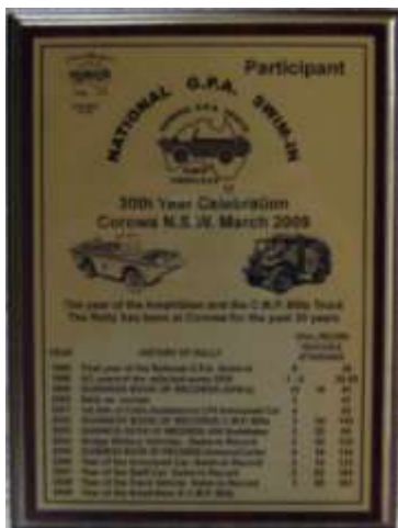
Last years design

I did this last year and it worked well and it is a visual record of the event with details.